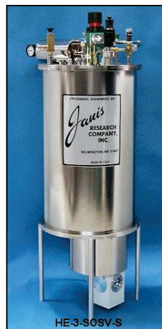
HE-3 Cryostat for FTIR