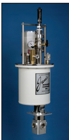
PT-950-5 for FTIR