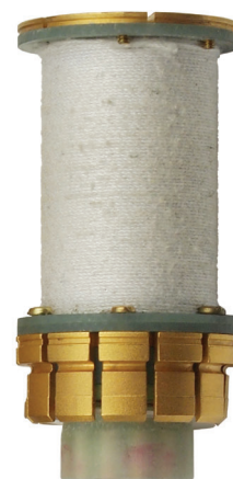
AC DR Coil Set