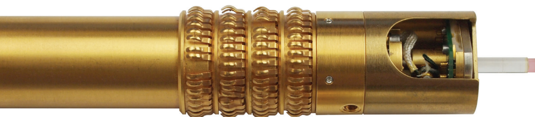
DR Probe with AC DR Sapphire Sample Stage