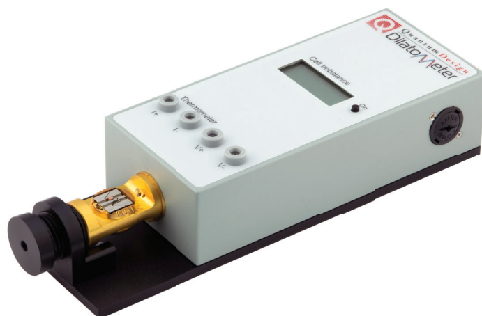
Dilatometer Capsule installed in the Balance Meter

Specifications are subject to change without notice.