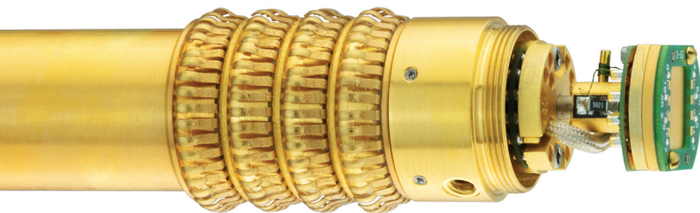
Dilution Refrigerator with Transport Puck