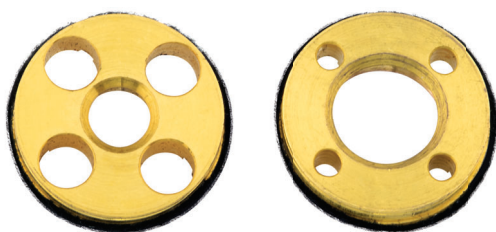
Comparison of the standard (left) and large (right) bore diameters for the available VSM coil sets.