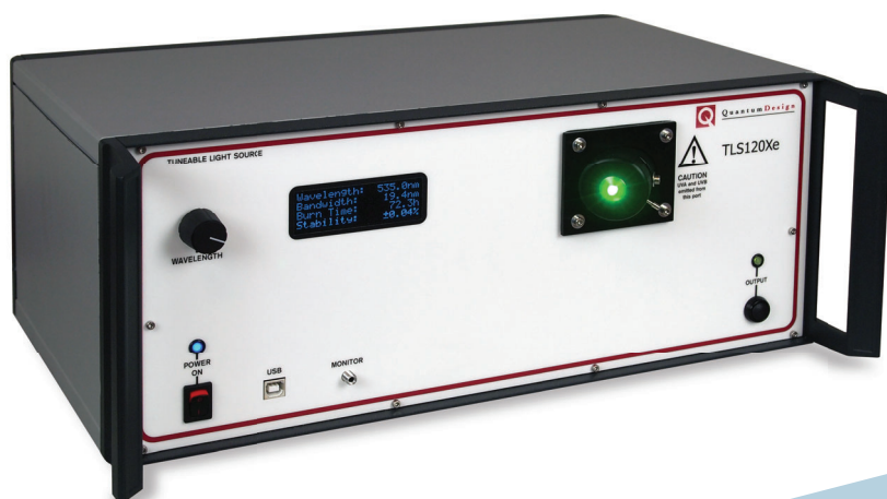
TLS120Xe with manual front panel controls active.